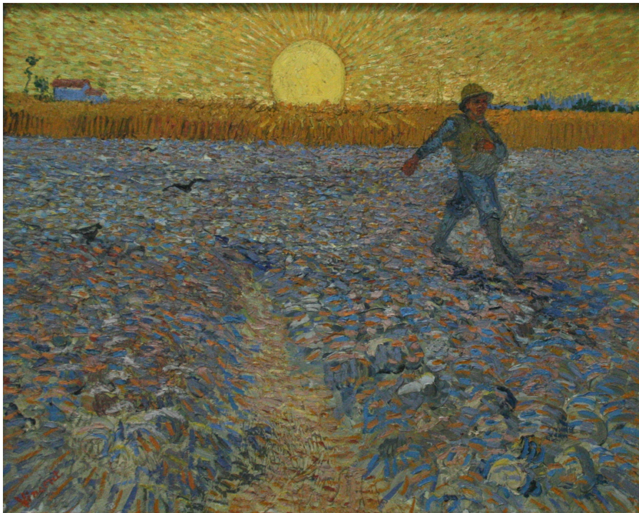
The Sower, Vincent Van Gogh, 1888

Holy Trinity Episcopal Church July 12, 2020 The Sixth Sunday after Pentecost