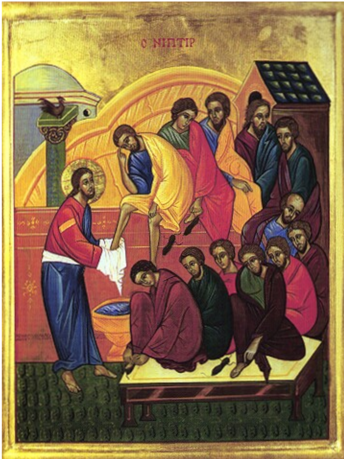
Holy Trinity Episcopal Church Maundy Thursday 2020