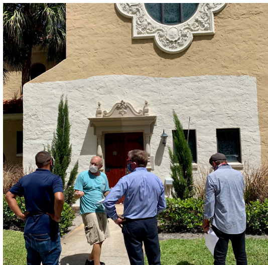
Walkaround with painting contractors.