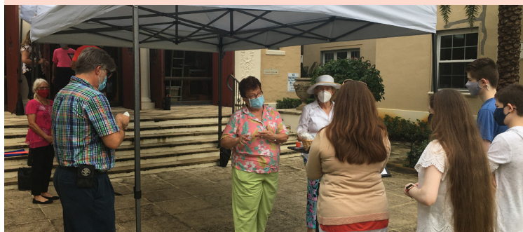
Regathering Volunteer Training!